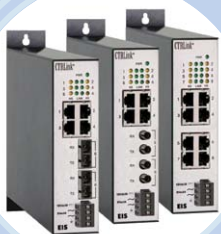
Industry Specific Switches