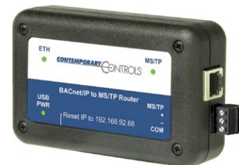
BAS Portable Router